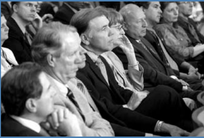
Alumni, staff, and students gathered in Wohlers Hall for the panel discussion on the future of higher education.

Alumni support has been critical to the success of the new Business Instructional Facility. Corporate support, as well as gifts from individual donors, will enable a state-of-the-art building for a 21st century education.